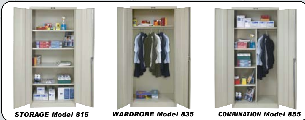
STORAGE Model 815

All-welded door frame assembly assures even closure all the way around. Doors are factory assembled in frame to insure accurate fit.