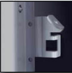
STANDARD 11 gauge single-point latch is MIG welded to frame