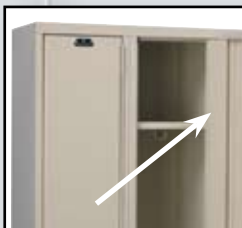
STANDARD A 3" wide 18 gauge full height door stiffener spot welded to the inner door face and MIG welded to the hinge side as well as to the top and bottom door flanges providing a rigid torque-free door. A 1-1/2" wide stiffener will be furnished for 9" wide Marquis doors.