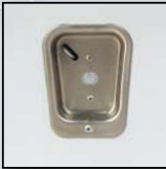
STANDARD Deep-drawn stainless steel recessed handle with single-point latching