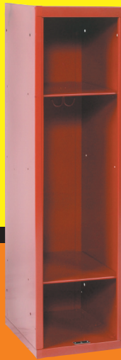
Primary II Cubbie