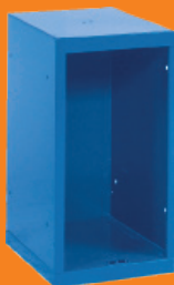
Primary Jr. Cubbie