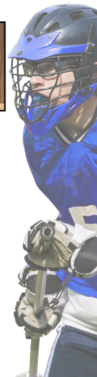
UV Full Color Print on security box door RLDOORLOGO

LEAD TIMES SHIPPING FROM MUNSTER, IN 1 - 25 24" WIDE LOCKERS 1 WEEK | 26 - 50 24" WIDE LOCKERS 2 WEEKS | 51 - 100 24" WIDE LOCKERS 3 WEEKS