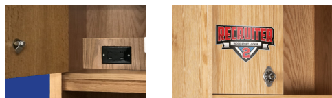
USB Outlet in Security Box USB-4 USB-4-110