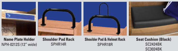
Name Plate Holder NPH-0212S (12" wide)

Order (1) Starter unit for each straight run of lockers and Adder units to fill out the run